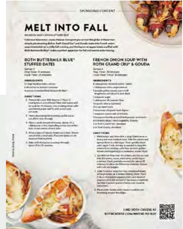
Above: An example of a sponsored print article and sponsored print recipe.